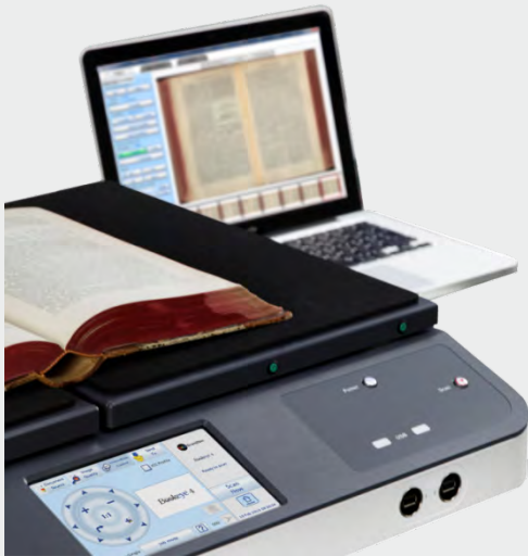
Bookeye® 4 V2 Professional with scan client.