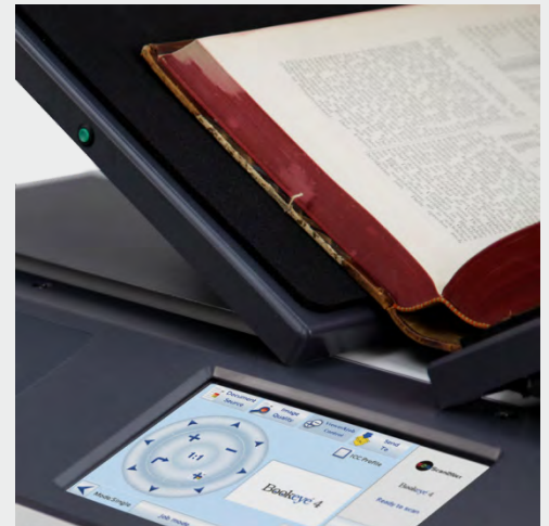
Book cradle in 120° V position.