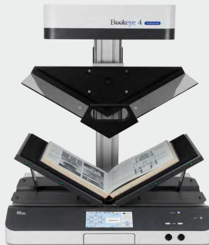
Option: V-glass plate