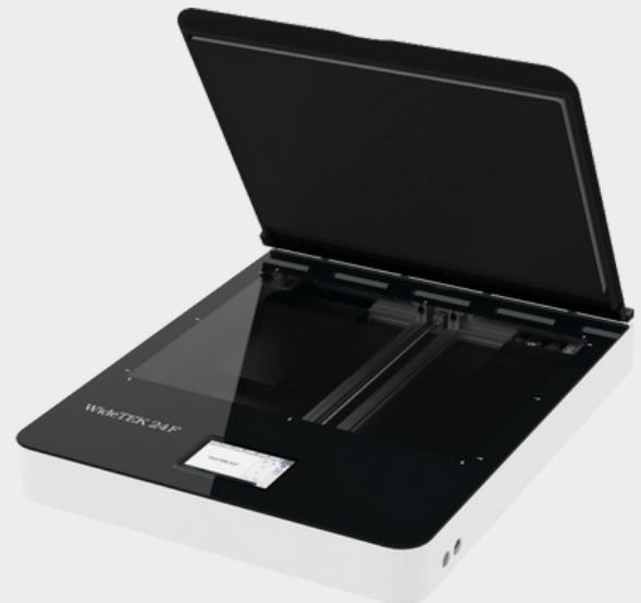
Scratch resistant glass plate enables scanning oversized originals