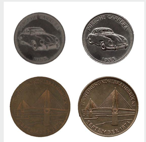
2D scan versus 3D scan, capture all details