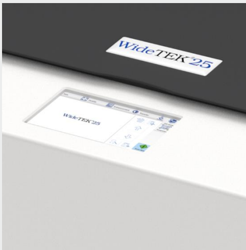
Large color touchscreen for simplified operation