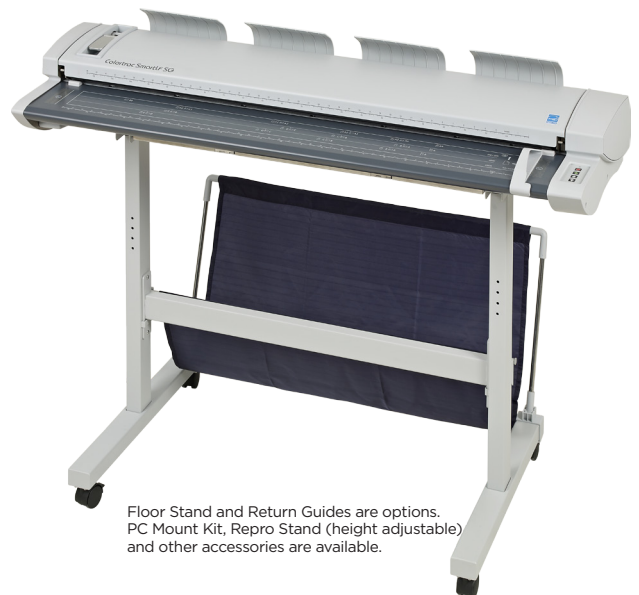
Floor Stand and Return Guides are options. PC Mount Kit, Repro Stand (height adjustable) and other accessories are available.