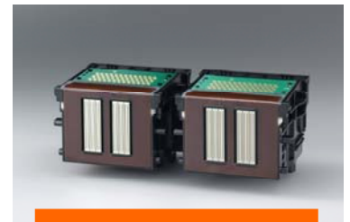
Dual Print-Head System