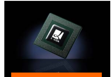
L-COA Image Processor