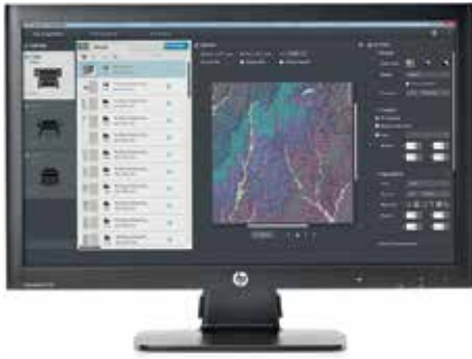
HP Designjet SmartStream

Especially designed for corporate reprographic departments in enterprises and repro houses looking for correct and easy PDF management, HP Designjet SmartStream is a professional software solution that cuts job preparation time by up to 50% on complex jobs, 4 and avoids reprints with accurate print previews.