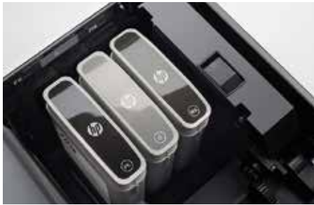
HP Three-black ink set

Improve productivity with the fastest MFP on the market 1 for all your black-and-white and color needs. Enjoy unattended operation at costs rivaling similar black-and-white LED MFPs. 2 This MFP is built for rigorous IT demands and top security.