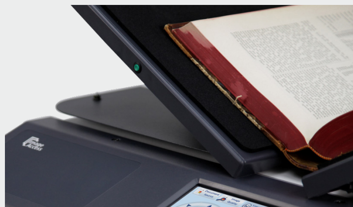
Book cradle in 120° V position.