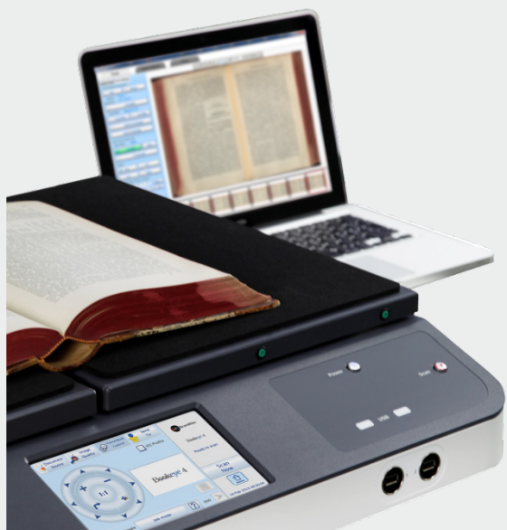
Bookeye® 4 Professional with scan client.

Image Access has four powerful software packages in its portfolio, which provide for optimal capture for large projects together with the Bookeye® 4 Professional. Batch Scan Wizard, BCS-2®, Opus Goobi UCC and Opus FreeFlow are designed to complement the Bookeye® 4 Professional and can meet any requirement within a digitization project.