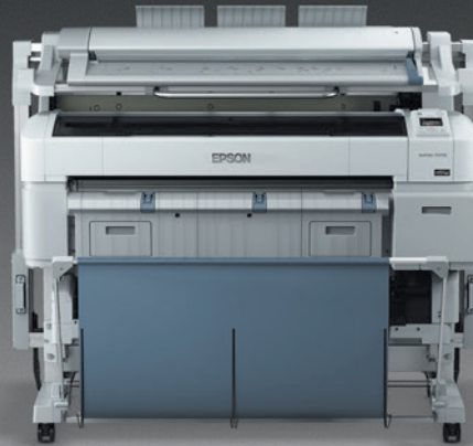
SureColor T5270D 36" Dual Roll Printer with Optional Multifunction Scanner