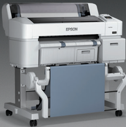
SureColor T3270 24" Single Roll Printer