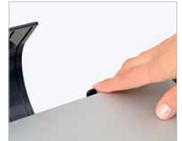
Paper pressure adjustment.