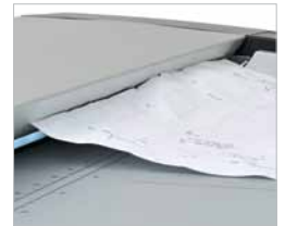
Fail-proof funnel-shaped paper feed for ease of paper insertion.